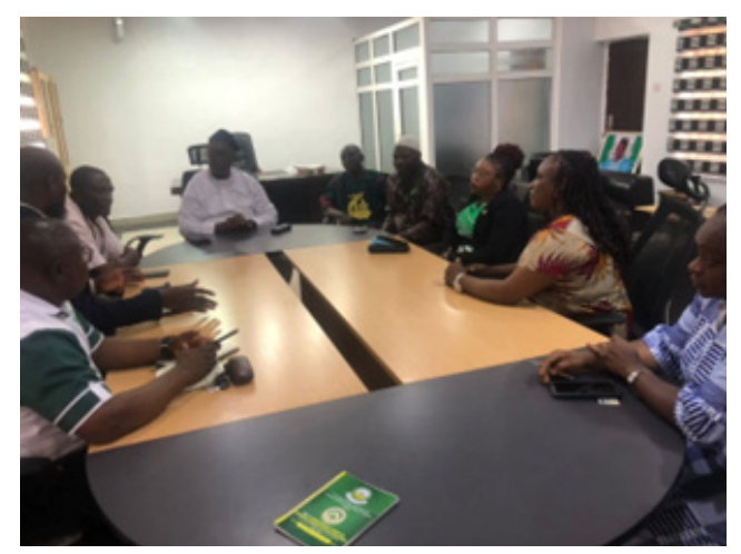
Members of Osun State Executives with the Honourable Commissioner for Regional Integration

Similarly, a courtesy visit was made to the commissioner of Lands and Physical planning for the same purpose. Responding, the Commissioner expressed his willingness to collaborate with the Institute on the advancement of the planning profession in the state.